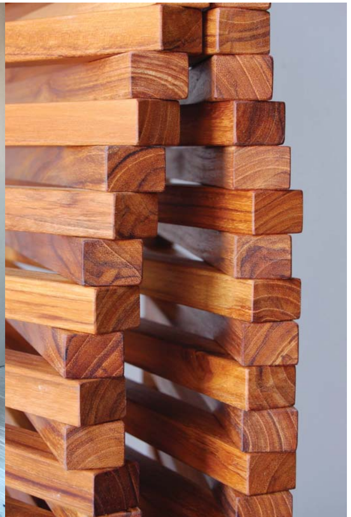
photo of teak