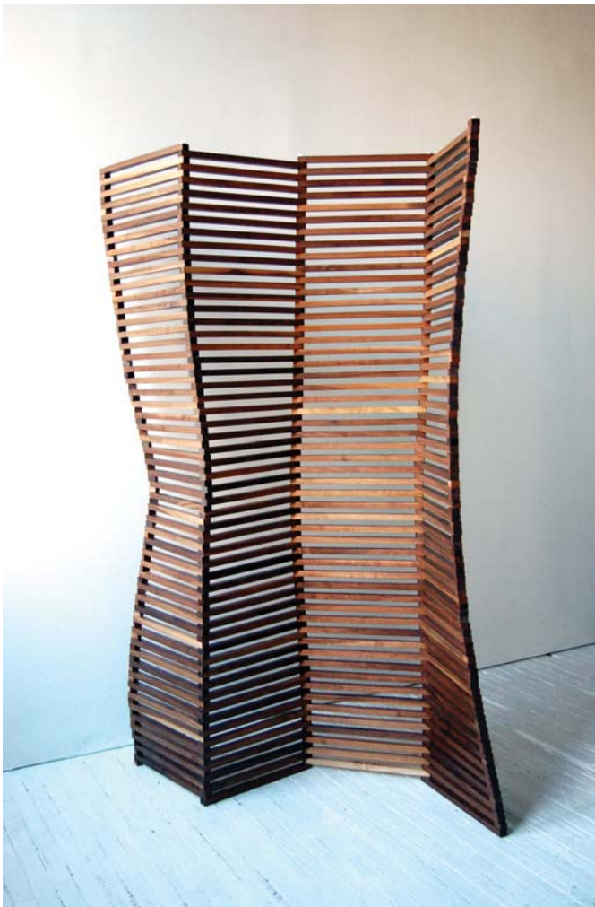
screen shown in walnut